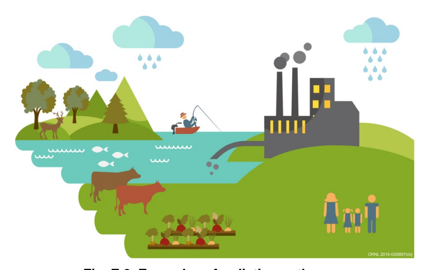
Fig. E.2. Examples of radiation pathways.

People can be exposed to radionuclides in the environment through a number of routes (Fig. E.2). Potential routes for internal and/or external exposure are referred to as pathways. For example, radionuclides in air could be inhaled directly or fall on grass in a pasture. If the grass were then consumed by cows, it would be possible for the radionuclides to impact the cow's milk, and people drinking the milk would be exposed to this radiation. Similarly, radionuclides in water could be ingested by fish, and fishermen or other consumers could then ingest the radionuclides in the fish tissue. People swimming in the water also would be exposed. Exposure to ionizing radiation varies significantly with geographic location, diet, drinking water source, and building construction.