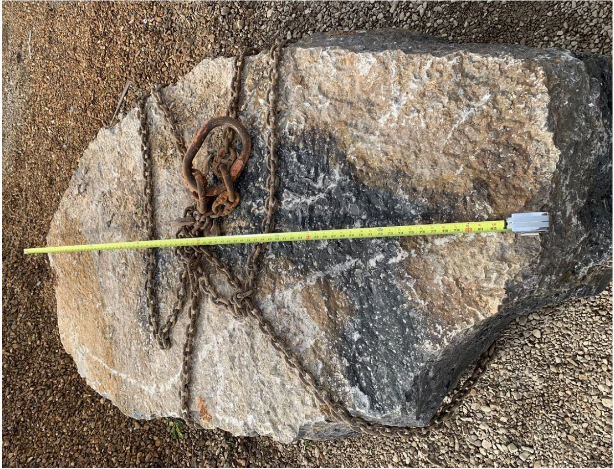
Figure 4 - Proposed Marker Stone Image