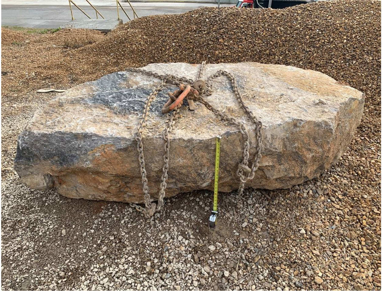
Figure 5 - Proposed Marker Stone Image