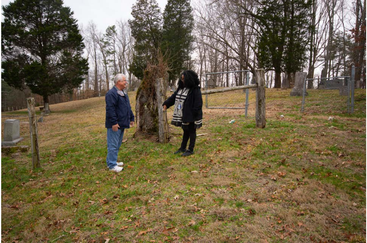
Figure 3 - George Jones Memorial Baptist Church Cemetery Proposed Marker Placement, Front Left of Cemetery Entrance