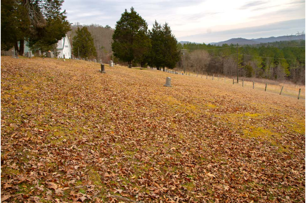
Figure 2 - George Jones Memorial Baptist Church and Cemetery